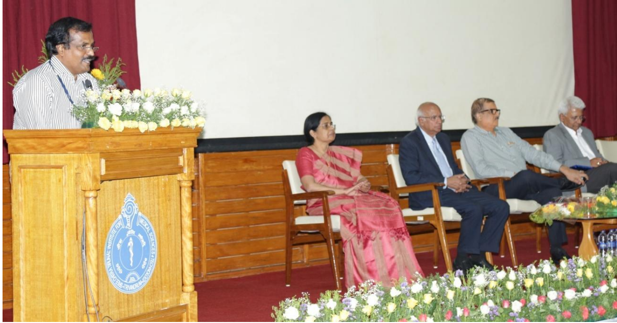
Recognition of contributions through CSR by President